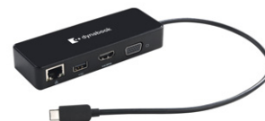
Dynabook USB-C™ to HDMI®/VGA Travel Adapter (PS0001UA1PRP)