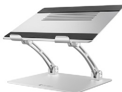
Adjustable Laptop Stand (PS0106EA1STA)