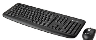
Wireless Keyboard and Silent Mouse Combo (PA5350E-1ETE)