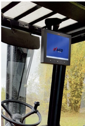
For faster work sequences picking processes