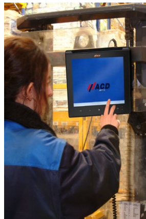
Optimization of picking processes